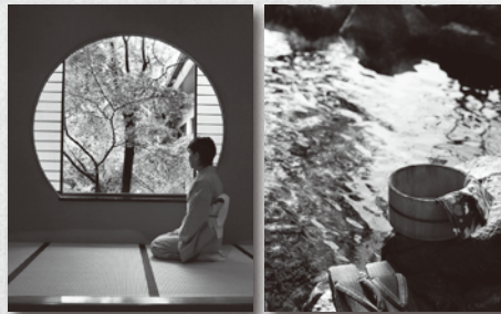
Fukushima is an "onsen(hot spring)" kingdom with 139 gushing hot springs.