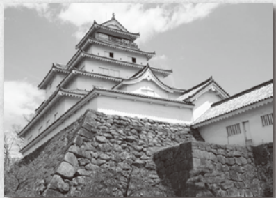
Aizu-Wakamatsu, which used to be a castle town during the Edo Period (1603-1867)