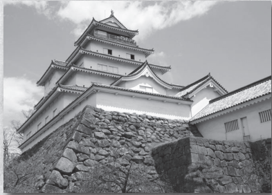
Aizu-Wakamatsu, which used to be a castle town during the Edo Period (1603-1867)