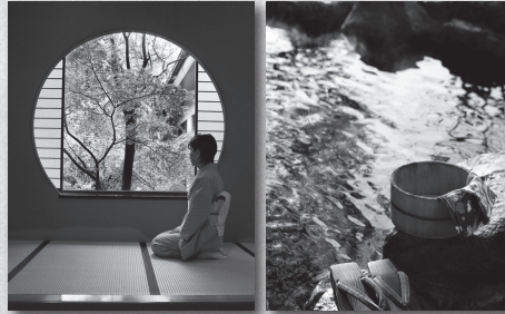
Fukushima is an "onsen(hot spring)" kingdom with 139 gushing hot springs.