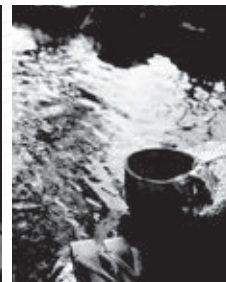
Fukushima is an "onsen(hot spring)" kingdom with 139 gushing hot springs.