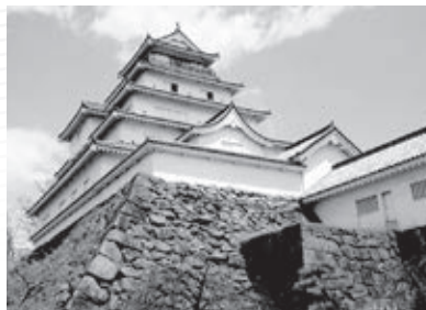
Aizu-Wakamatsu, which used to be a castle town during the Edo Period (1603-1867)