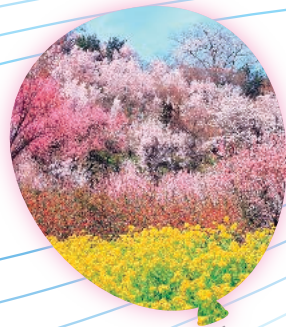
Fukushima City "Hanamiyama Park"