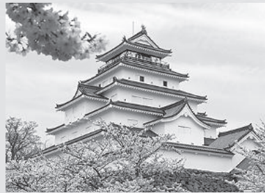
Aizu-Wakamatsu, which used to be a castle town during the Edo Period (1603-1867)