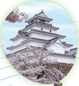
Aizuwakamatsu City "Tsuruga-jo Castle"