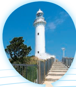
Iwaki City "Shioyasaki Lighthouse"