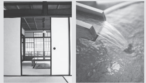
Fukushima is an "onsen" (hot spring) kingdom.